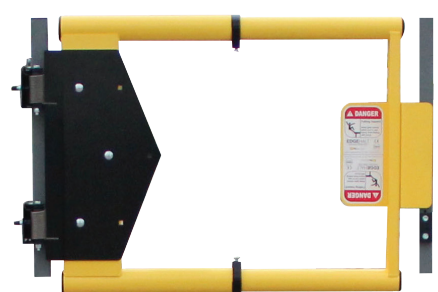
Product Number: ASG-1836-PCY